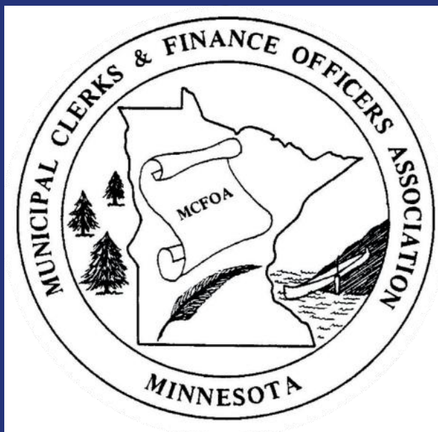
Exhibit Show March 21, 2024